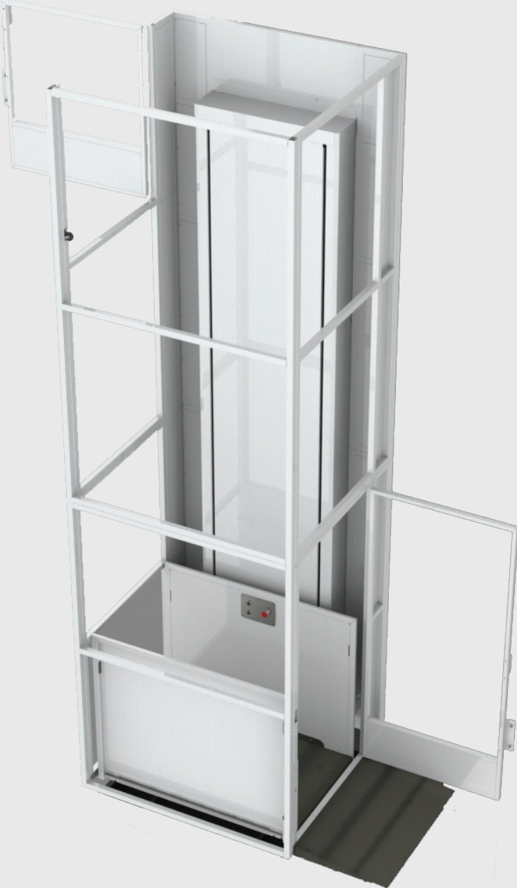
VPL-ELP shown with acrylic enclosure infill panels

VPL-EL & VPL-ELP for Residential & Commercial Applications